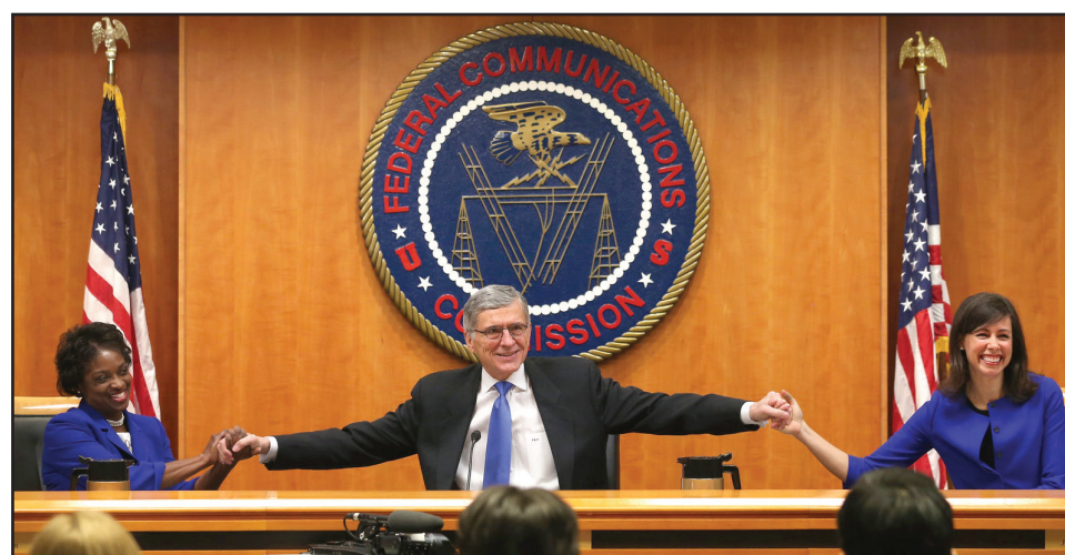
At the start of a meeting to decide the issue of net neutrality, Federal Communications Commission Chairman Tom Wheeler, center, holds hands with FCC Commissioners Mignon Clyburn, left, and Jessica Rosenworcel at the FCC headquarters Thursday.

Seeing the new policy as an attempt to intrude on the Internet, Pai predicted higher costs for consumers and less innovation by businesses.