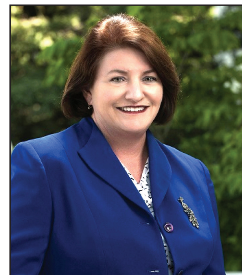
Assembly Speaker Toni G. Atkins